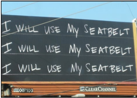
Sign at West Park and HWY 6 paid for by The Texas Department of Public Safety.

Share Your Knowledge of "The way it was" in the Greater Mission Bend Area! GMBACouncil@SBCGlobal.Net