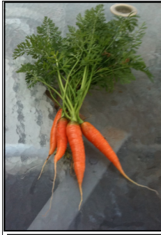
Grown in a Pot